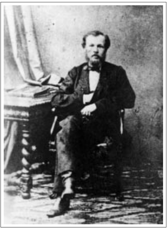
Mendeleev in St. Petersburg, Nov. 19, 1861

als. However, since he defined the concept of element without the notion of atoms, he considered atomic weights to be the fundamental property of the elements. They were not necessarily based on atomic theory, which was still somewhat speculative. Thus, the scope of atomic weights would have to be broader than that of definite proportions on which the atomic theory was thought to be based. Mendeleev even once suggested the use of the word "elementary