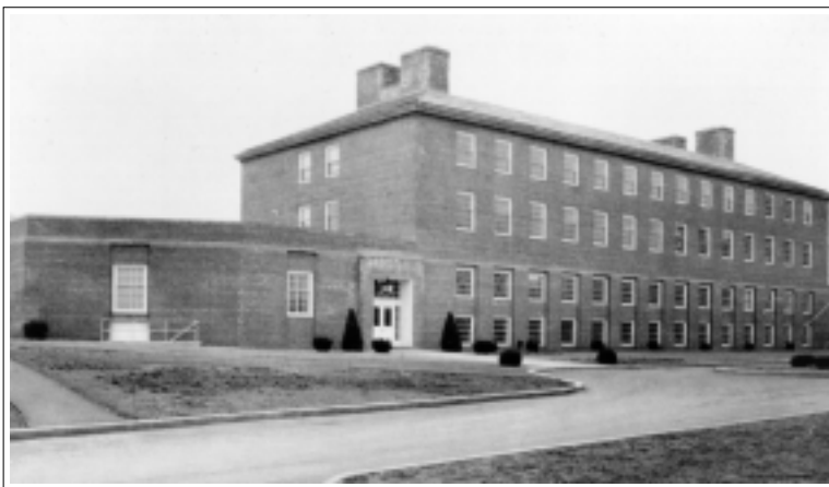
Olin Hall of Science

$1.25 million for the construction of a 40,000 square foot engineering science building to house the physics, chemistry, graphics, and mathematics departments. Dedicated on January 11, 1957, it is still in use by the chemistry department (45,46).