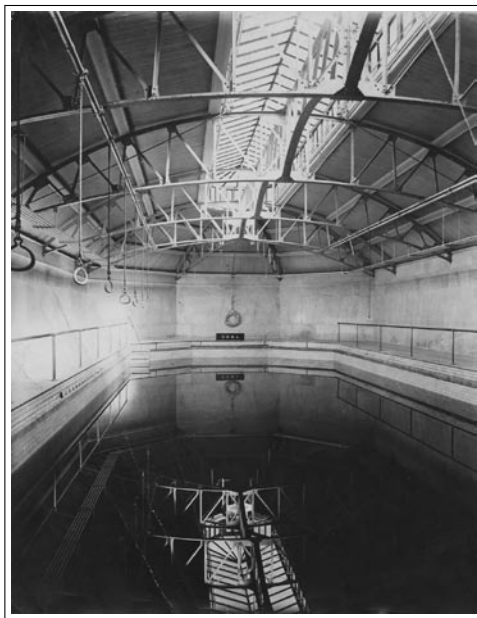
Figure 2. Colgate Hoyt Pool

About the same time as the Brown University experiment the Lancet was publishing papers related to the bacterial contamination of swimming baths and means to sterilize them, including chlorination (29, 30). A decade later the Lancet reported that chlorine levels of 0.5 to 1.0 ppm were sufficient for this purpose (31).