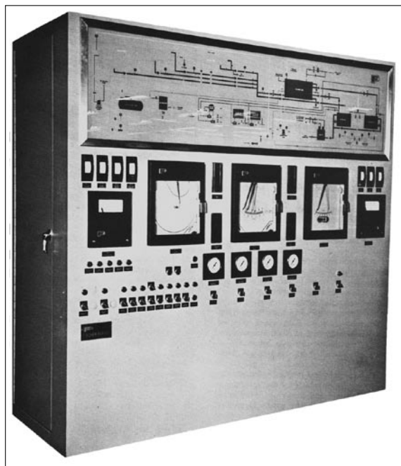
Figure 4. Installed at the New Hyde Park Municipal Pool, in Hyde Park, New York, this late 1960s system automatically monitored and controlled chlorination, alkalinity, filtering, and water levels.

By the middle of the twentieth century a new class of chlorinating compounds was available. These were compounds consisting of chlorine with cyanuric acid. Early experiments demonstrated that sodium dichloroisocyanurate and potassium dichloroisocyanurate are the most stable and have the best solubility of this class of compounds. Like earlier compounds, these materials function as a source of hypochlorous acid. The disadvantage of these materials is that the pool water must contain some cyanuric acid as a stabilizer. This prevents the chlorine from being lost to ultraviolet radiation. On a sunny day, as much as 70% of chlorine may be dissipated from an unstabilized pool (38). When used correctly the combination of dichloroisocyanurates and cyanuric acid stabilizer provides long lasting chlorine, good solubility, ease of application, and is unaffected pH (38). Today the typical residential pool owner uses a combination