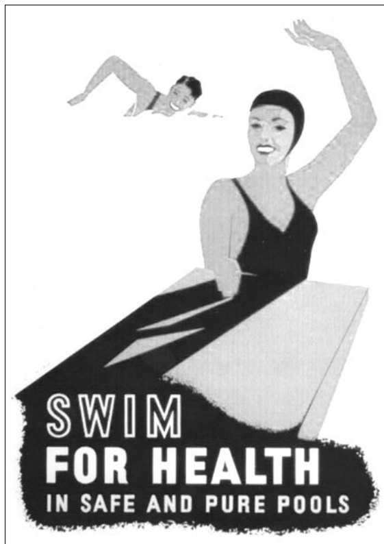
Figure 3. WPA Poster titled "Swim for health in safe and pure pools," Library of Congress.

certain inorganic species. The amount of oxidizing agent required to destroy the impurities present at the time of addition is the "chlorine demand" and the unchanged material is the "residual chlorine." Most pool chemical suppliers recommend keeping the residual chlorine at a concentration of no more than 2 ppm. "Shocking" a pool refers to adding excess chlorine (2.0 to 5.0 ppm) so that once the chlorine demand is met, a massive excess of chlorine "shocks" the water.