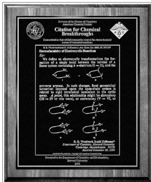
Figure 3. Citation for Chemical Breakthrough award plaque presented to the Department of Chemistry and Biochemistry, Harvard University, on June 16, 2006 to honor the first Woodward-Hoffmann paper on orbital symmetry. The design of this plaque (raised metal etching on a walnut base, 15" x 18") is similar to others presented in this award program. These plaques are intended to be placed in the halls near the location of the original discoveries.

Certainly review articles – and the entire series Organic Reactions -- are written by many research chemists who would never consider themselves historians of chemistry, yet these reviews fit within the umbrella of history of science. Chemical & Engineering News includes historical context in many of their feature articles and publishes numerous articles and even special issues focusing on the history of chemistry. C&EN's readers are scientists and engineers within the broadly defined discipline of chemistry. The series of autobiographies of eminent organic chemists, Profiles Pathways and Dreams that I edited was produced primarily for the practicing chemist, not for the historian of chemistry, though over the long term, the latter will be the eventual beneficiary.