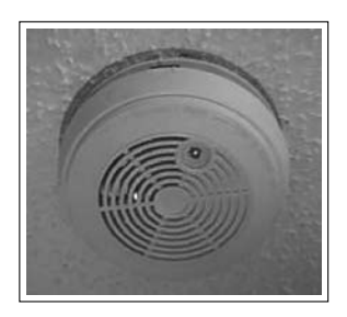
Figure 3. Residential ceiling-mounted smoke detector.

Neutron sources containing Am-241 that furnish alpha particles find use in oil well logging, determining soil density and moisture content, measuring moisture content of coke and concrete, and in the activation analy-