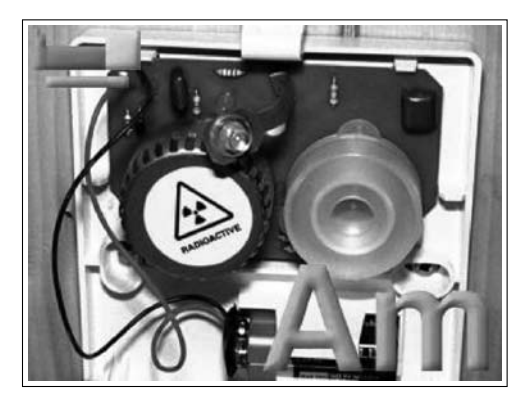
Figure 4. Inside a smoke detector.

mity of thin films, and help to determine the relative humidity of air (5).