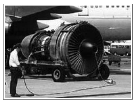
Figure 5. Gamma radiography.

More recent work has led to the preparation and study of nitrides, phosphides, sulfides, monochalcogenides, and monopnictides of americium (21 - 24). This work has included the study of how pressure affects the nature of the element's 5f electrons (25) and even the pressure effects on the superconductivity of AnTGa<sub>5</sub> systems where An = Np, Pu and Am, while T = Co, Rh and Ir (26).