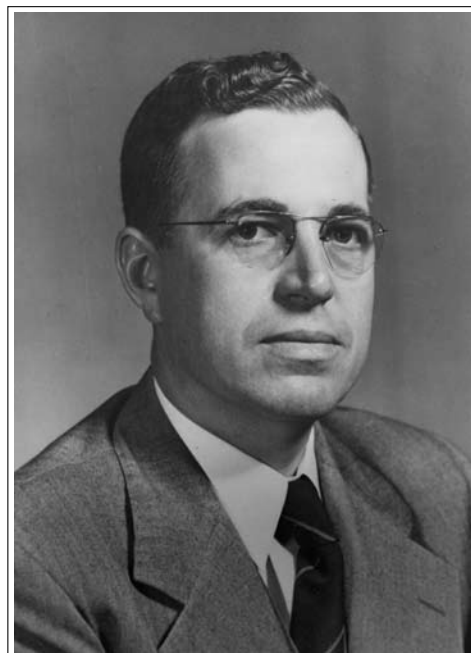
Arthur C. Cope

Arthur C. Cope earned his B.S. in chemistry from Butler University in 1929, and Harry S. Mosher completed a B.S. in chemistry from Willamette University in 1937. These two institutions were founded with remarkably similar missions. Butler was founded in 1855 on the audacious vision to provide interracial coeducation to aspiring students (14), and Willamette, founded in 1842, was one of the early coeducational institutions (15). Butler was the third school in the nation to award a bachelor's degree to a woman, and Willamette's first