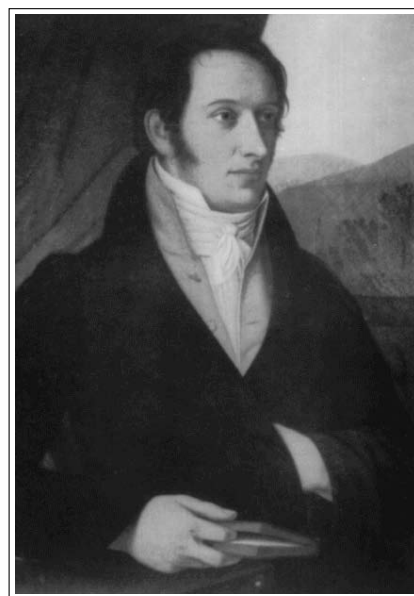
Leopold Gmelin (1788-1853)