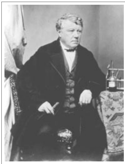
Christian Friedrich Schönbein, 1799-1868

Ozone has been known as an accompaniment to electrical storms during all the history of mankind. Its first identification as a distinct chemical compound was due to Christian Friedrich Schönbein (1) (Fig. 1), Professor of Chemistry at the University of Basel from 1828. To a considerable extent he dominated the study of ozone chemistry until his death in 1868. The molecular formula of ozone was determined in 1865 by Soret and confirmed by him in 1867, shortly before Schönbein's death. The year 1999 marks the 200th anniversary of Schönbein's birth and is a fitting time for a presentation of the early history of ozone from the time of his first report through the rest of his lifetime. It is interesting to note that at least 13 citations of Schönbein's work on ozone have appeared in the chemical literature during the period 1988-98.