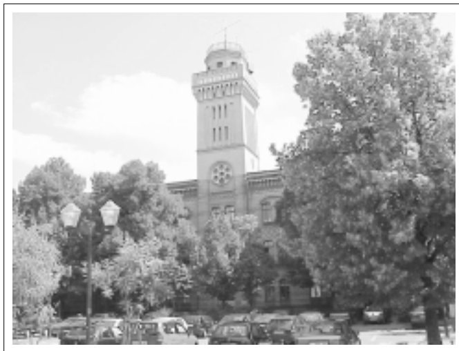
Figure 3. Physikalisches Institut Building of Friedrichs Universität. Ernst Dorn conducted his “radium emanation” studies on the steps of the basement of this building.

In a private note to Rutherford, Mme. Curie suggested the phenomenon might be a form of phosphorescence (31). This “radioactive energy” was baffling; vague descriptions were offered, for example, that they were “centers of force attached to mol-