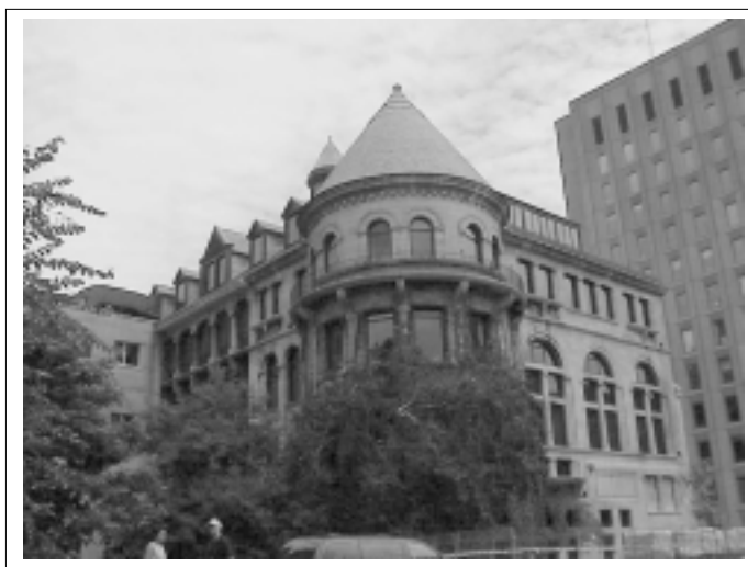
Figure 4. The Macdonald Physics Building, where Ernest Rutherford performed his work. The building is now used as a library.

[Ramsay and Rutherford had discovered argon, and Ramsay had discovered the inert gases neon, krypton, and xenon during the previous decade] (37). All this research was done on the emanation from thorium. Rutherford quickly followed up with a similar