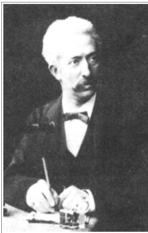
Figure 1. Friedrich Ernst Dorn (1848-1916), Geheimer Regierungsrat Professor of Friedrichs Universität, Halle (Saale). (Portrait at the University of Halle; photograph by the authors).