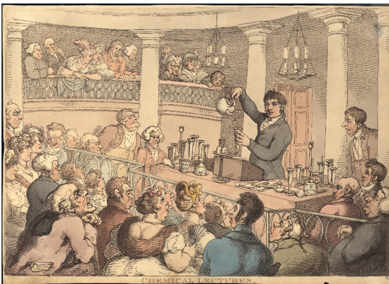
Figure 2. Thomas Rowlandson's cartoon of Fredrick Accum in one of his public lectures at the Rotunda in the Surrey Institution.

One of the great qualities of Accum was his capacity to foresee the industrial importance of many chemical novelties. Gas-lighting and the coal-gas industry are important examples, although many others can be found including the industrial processing of beet-sugar and the practical utilization of the distillate from coal tar, a by-product of gas manufacture. The latter would be of special relevance a few decades later, considering that mauveine, the coal tar derived dye accidentally discovered by William Perkin in 1856, was the origin of the British dyes industry (30).